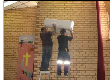
The men from Nordic.