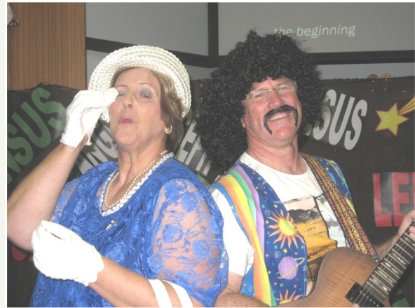
Hyacinth is dismayed as the Orchestra leader has an electric guitar instead of a violin!

We would like to thank everyone who contributed to the events success. I'm sure that Hyacinth would have been suitably impressed with the supper, if nothing else!