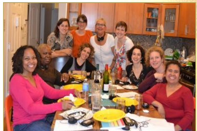
This is a representative meeting of engineers. Our group prefer to be heard and not seen!