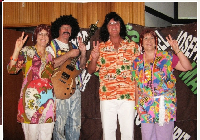
The Four Peace band.