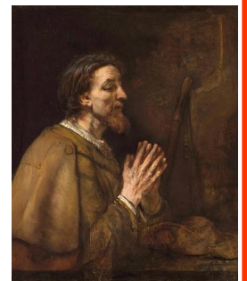
St James the Elder

Some say that James evangelized all of Spain. Today the amount of his mission work in Spain is a matter of debate.