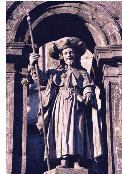
Statue of St. James the Elder, Cathedral of Santiago de Compostela, Spain.

What do the symbols on the St James Coat of Arms represent?