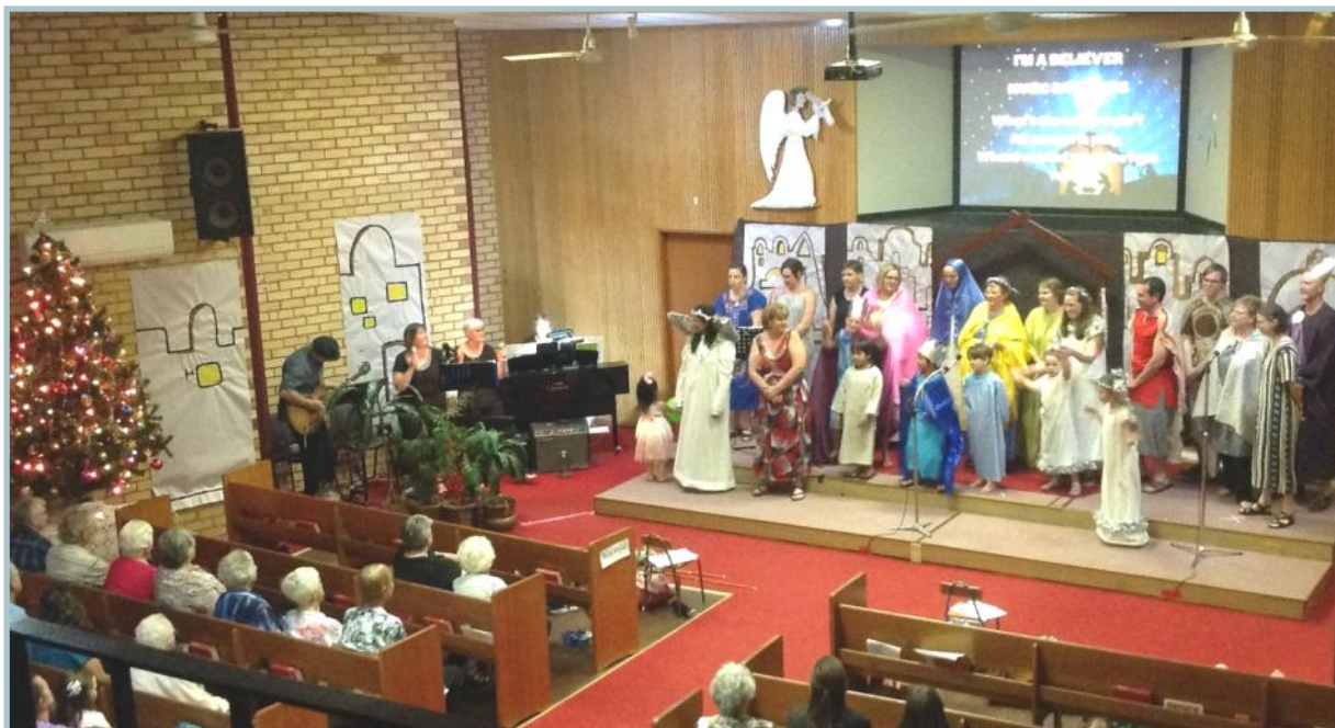
The cast and the Band sing their final number.