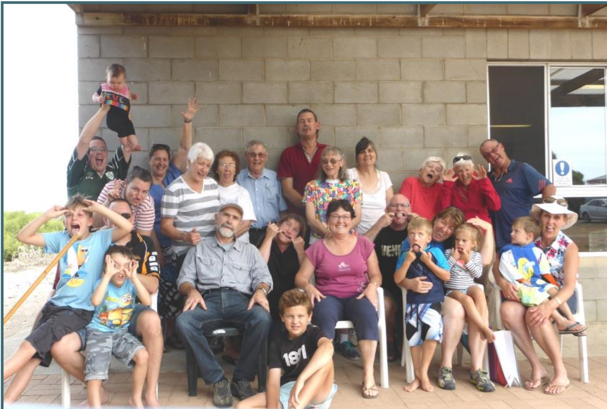
Everyone in the same place at the same time. Remarkable!