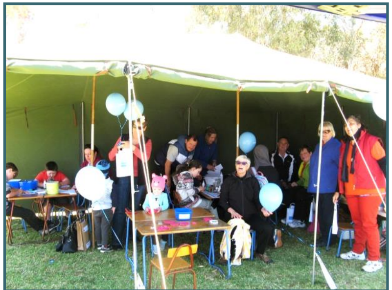
Children have fun with craft and glue whilst their parents gather their breath.