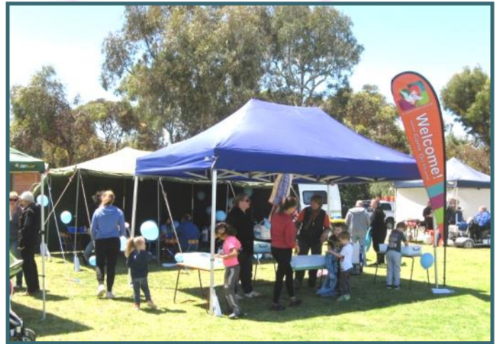
Children play in the gloop and bubbles

At the end of the day, everything has to be dismantled and taken back to the Church, so it's although it's a busy day, there is also lots of opportunity to mix and make connections.