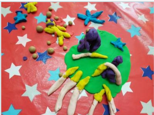
The children's depiction of the stoning of Stephen

Thanks also to the parents who regularly bring their children to worship.