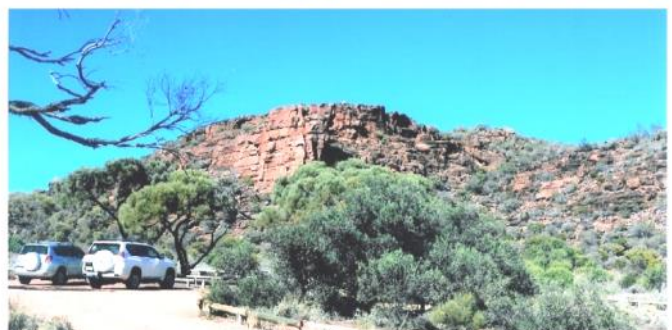
Picnics at the Wetlands and Wild Dog Hill were a couple of outings enjoyed by the Support Group